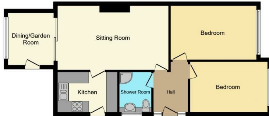
Ground Floor Floor area 70.7 m 2 (761 sq.ft.)